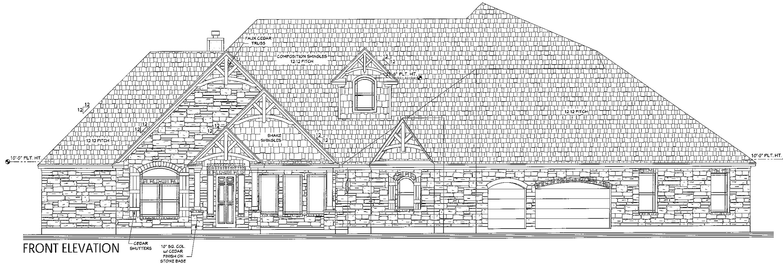
FRONT ELEVATION CEDAR SHUTTERS 10" SQ. COL. w/ CEDAR FINISH ON STONE BASE